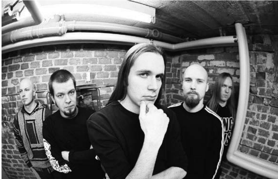
DEMIGOD

The Slumber Of Sullen Eyes re-release is available through www.xreemmusic.com . The band has some t-shirts left as well as mp3 samples from their past releases and additional info at www.demigod.tv . ■