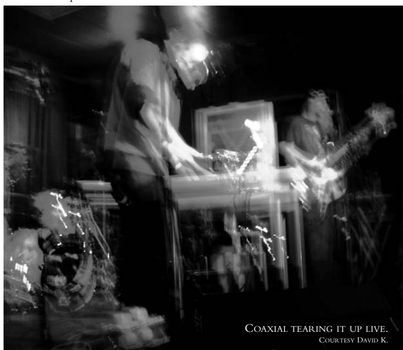
COAXIAL TEARING IT UP LIVE.

Fair enough. But David still has more to offer in the way of a description of The Phantom Syndrome .