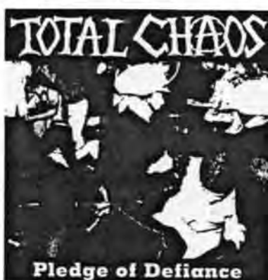
TOTAL CHAOS - PLEDGE OF DEFIANCE 86438 LP/CD/CS