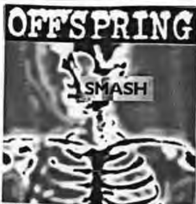
OFFSPRING - SMASH 86432 LP/CD/CS

To wrap this all up I'd just like to say let's get it all back together! We all need each other!