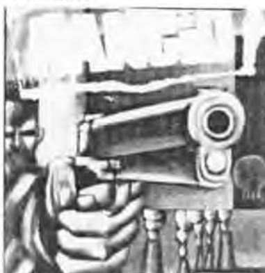
RANCID - RANCID 86428 LP/CD/CS