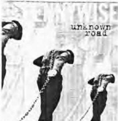
PENNYWISE - UNKNOWN ROAD 86429 LP/CD/CS

TO HEAR THE LATEST STUFF ON EPITAPH CALL: 1(213) I OFFEND (463 3363)